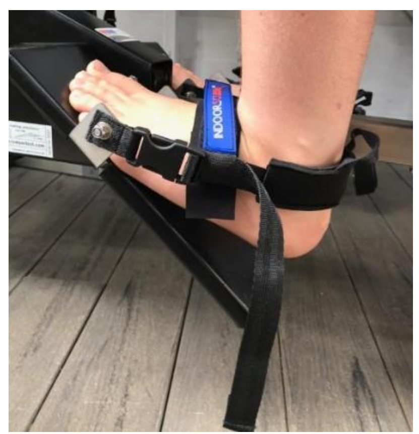
Rowperfect Footstraps - A Testimonial

It can be a little exasperating seeing rowers insist on using - or even adding! - a top strap to the Indoor Sculler's footplates.